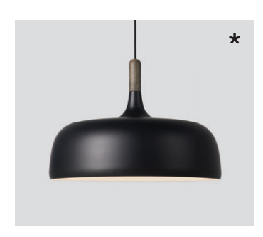
Acorn white - Item no. 540