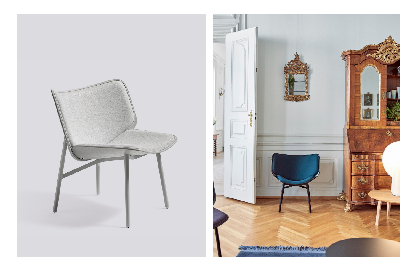
Dusty grey stained oak shell Divina Melange 120 front upholstery / Dusty grey steel base