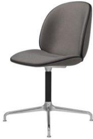
Metallic screws + washers