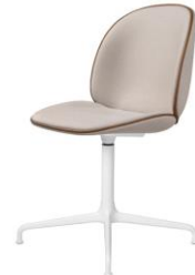
Metallic screws + washers