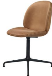
Black screws + washers