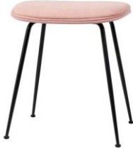
Beetle dining stool