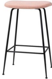
Beetle counter stool