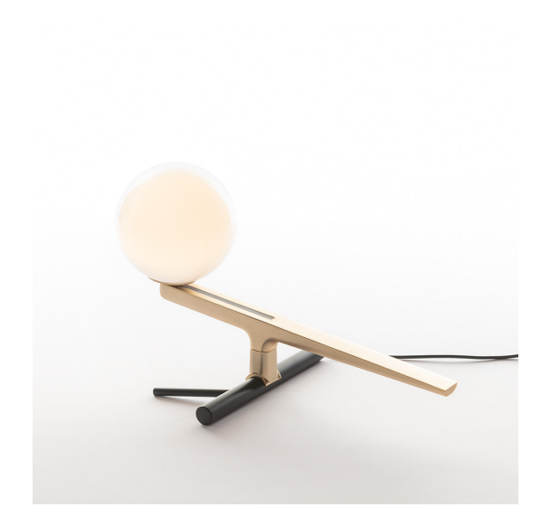
IP20 🕸 🌃 ( E