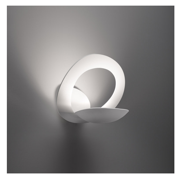
IP 20 (⊕) (X) (F) (III) (C) (E) Dimmerable: +① -