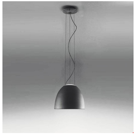
IP20 🖺 🌃 [[[] o Dimmerable: +0-