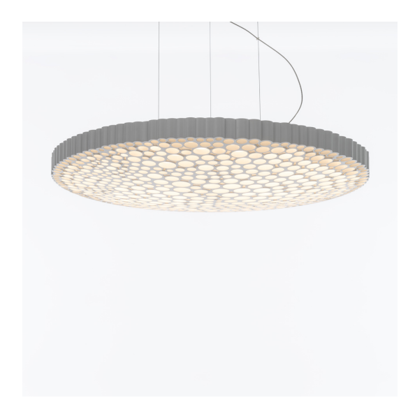
IP20 🖺 🎉 🕻 🕻 Dimmerable: +0-