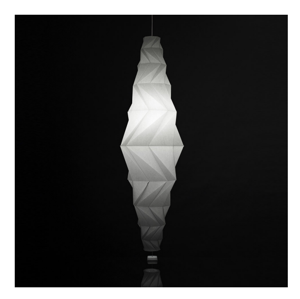
IP20 ( ☐ Dimmerable: +0-