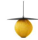
// Venetian Gold