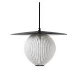
// White Cloud