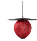
// Shy Cherry