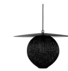
// Midnight Black